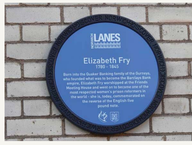
26 Plaques may play an educational role by drawing attention to subjects who were of significance, but whose names are not necessarily well known. An example is Elizabeth Fry, prison reformer, commemorated at the Friends Meeting House, Upper Goat Lane, with a plaque erected under the joint initiative of Norwich HEART and Norwich City Council.

A number of other schemes have followed a similar approach (and, indeed, wording), both with regard to a figure's significance and the need for a positive contribution. However, while the criteria of English Heritage require that figures, events or institutions be of national (or even international) significance — an approach that reflects the historical richness of London and the national remit of EH — such considerations may not be applicable to other schemes, especially those focused on particular geographical areas.