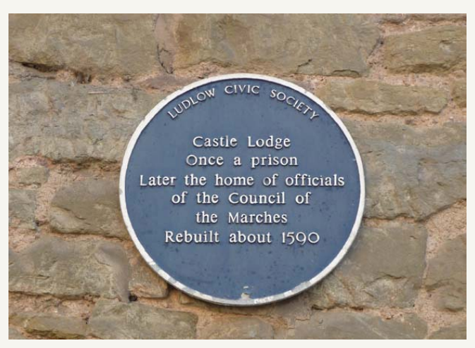
27 Many plaques seek to draw attention to the history of certain historic buildings, and not solely to their historical associations. For instance, this plaque erected by the Ludlow Civic Society, Shropshire, to commemorate Castle Lodge, Castle Square.