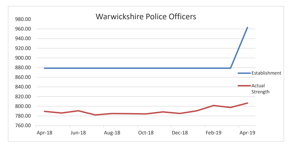
Graph 1. Police Officers – Current Position

The process for the recruitment of the additional police officers funded by the precept for 2018/19 has been challenging due to time scales involved in advertising, application, selection and training. The information provided below illustrates both the current and projected position in terms of police officer numbers.