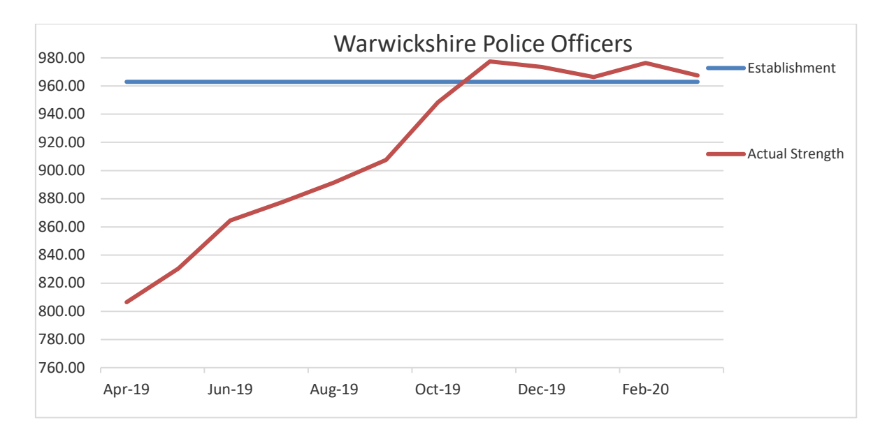
Graph 2. Police Officer Establishment – Projected 2019/20